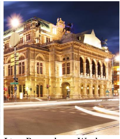
Highlights... Würzburg, Rothenburg, Passau, Linz, Regensburg, Wachau Valley, Vienna, Bratislava, Budapest

Day 1: Monday, September 21, 2015 Overnight Flight Sail past breathtaking scenery pausing along the way in quaint villages and lively cities on a timeless trip down the Danube River. Your tour opens with an overnight flight to Europe.