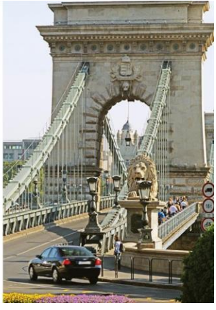
11 Days • 23 Meals: 9 Breakfasts, 6 Lunches, 8 Dinners