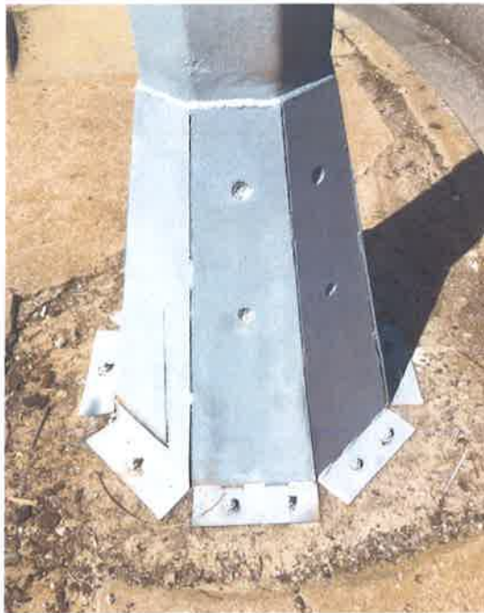
NE 72 nd Street & N. Troost Avenue – Traffic Signal Base (After Temporary Repair)