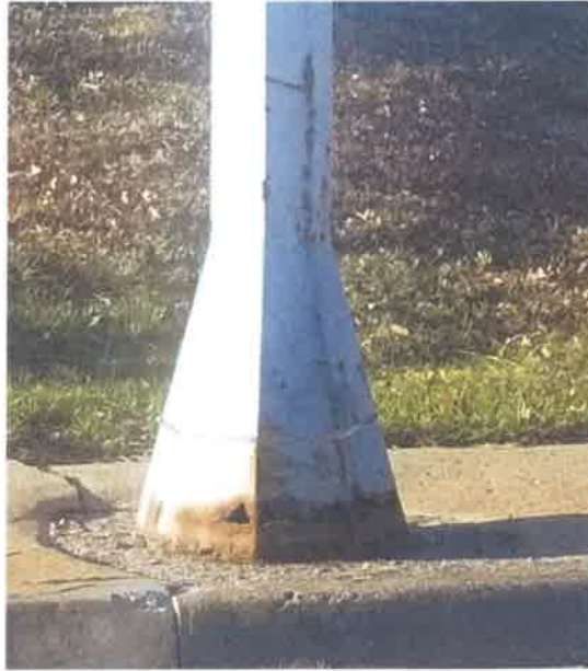
NE 72 nd Street & N. Troost Avenue – Traffic Signal Base (Prior to Temporary Repair)