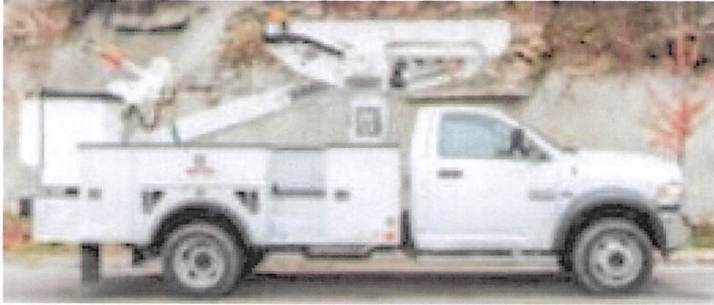
Versalift VST-40-MHI Aerial Lift on Ram 5500 Truck Chassis