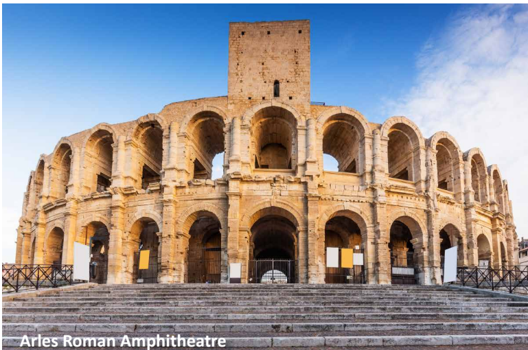
Arles Roman Amphitheatre