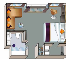
Suite Mozart Deck (284 sf)

All suites are on the Mozart Deck and have panoramic windows with exterior Walk Out Balcony, two twin beds that can be separated or put together, a private sitting area, flat screen TV, mini-bar, private bath with shower, hair dryer, phone, closet, desk, chair, safe & offer 284 square feet of floor space. (Suite size and amenities can vary)